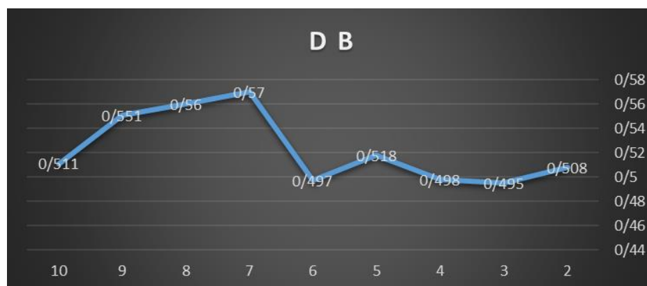
Figure 2. Davis-Boldin index chart.

Given that the minimum value obtained is the optimal number of clusters, then the optimal value for the Davis-Boldin index is number 3. As a result, customers are grouped into 3 clusters.